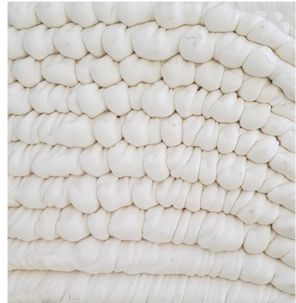
Approx a meter height of a portion of a wall sample printed in polyurethane.

However, the polyurethane has high rate of expansion and rapid solidification. This means that the final extruded and rigidified deposition has, within an interval, an unpredictable shape. The small scale variability of the material is high, resulting in a surface rugosity of few dozens millimeters. (See photo below)