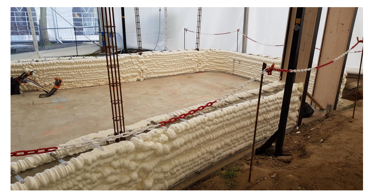
printing and construction progress at the time of the visit.

The whole setup is installed under a temporary tent, which protects the machinery from undesired weather conditions.