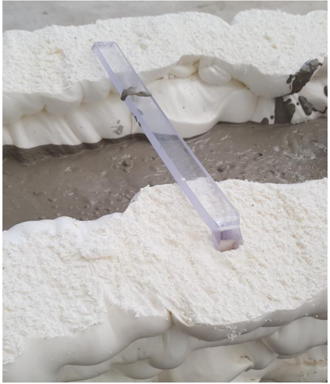
Acrylic ties installed on top of the polyurethane foam.

thermally bent so that the ends can be inserted in the foam. The ties have the role of holding the two walls together when the casting is made, and during the curing of the concrete. In plan, these are placed at every 250 mm.