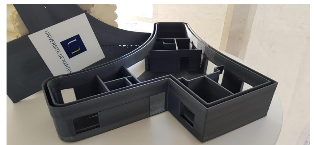
3D printed model of the house showing the plan layout and internal wall partitions.

The walls will be finished with fiberglass mesh and plastered on both interior and exterior sides, as shown in the image above.