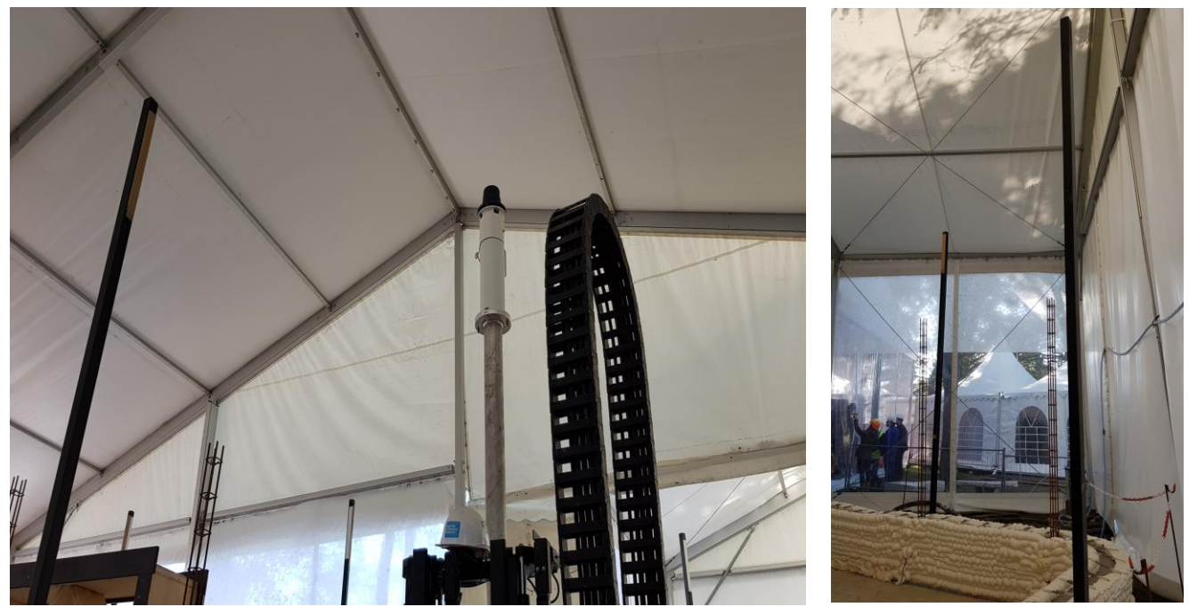
Laser beacon on top of the robot (left image) and laser receptors (right image).