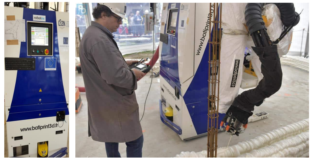
coverage required for architectural application, as well as multiple reaching angles.

The printing system consists of two robots which work together synchronized to achieve a large scale