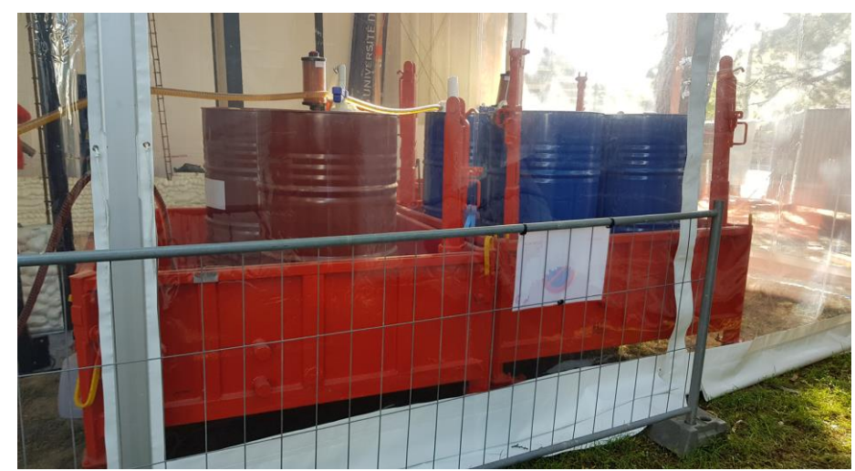
pressurized so when the extruder releases the material, it flows out.

The extruder is connected to the polyurethane canisters of the two material components. These are