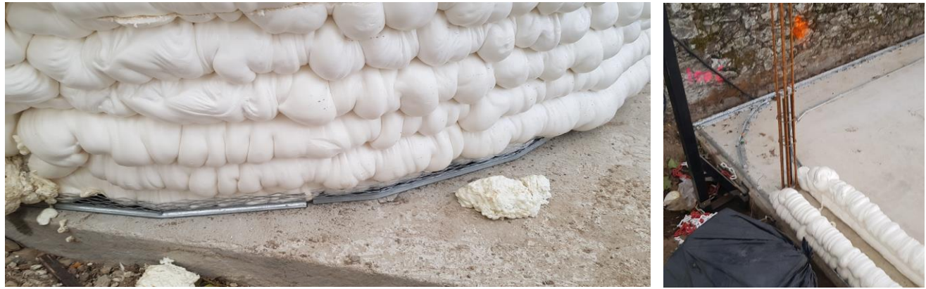
house through the foundation.

approximately every 3 to 4 meters. The doors and window frames are installed as well. The area of the foundation is just slightly larger compared to the area of the house including the walls. The foundation exceeds the perimeter of the walls mostly where the walls curve in plan; these corners highlight the discrepancies of the traditional construction methods when used in conjunction with digital fabrication. Sewers, water inlet and the electrical wiring system have been brought into the