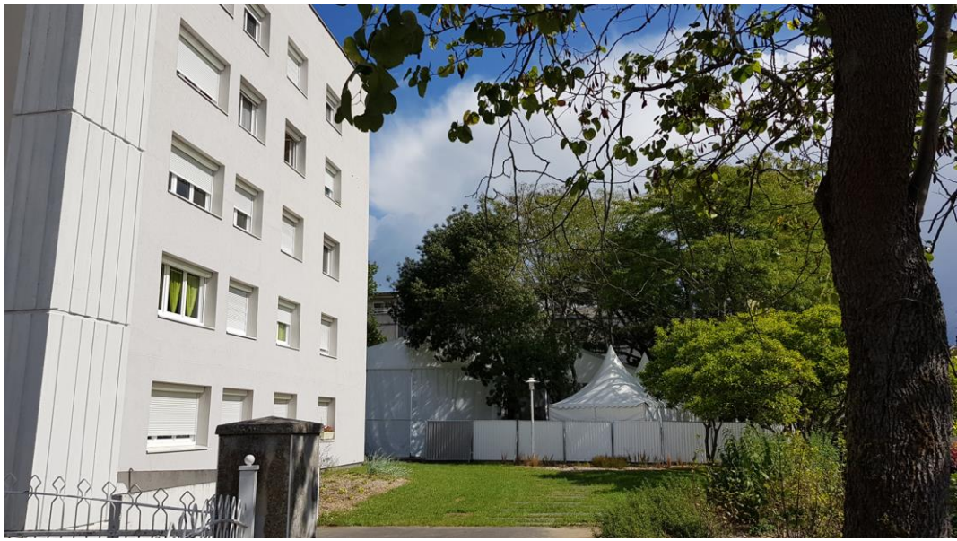
Location of the Yhnova House.

The printing is carried on directly on site. Due to the high versatility of the system, the only requirement for the printer is a flat surface on which to run. Considering the high precision of the industrial machinery, very low tolerances are part of the system, therefore small differences in the non automated parts of the construction have high negative impact. This is the case for the foundation, which acts as the platform on which the two robots access the printing areas. However, the system can compensate for these in the material deposition.