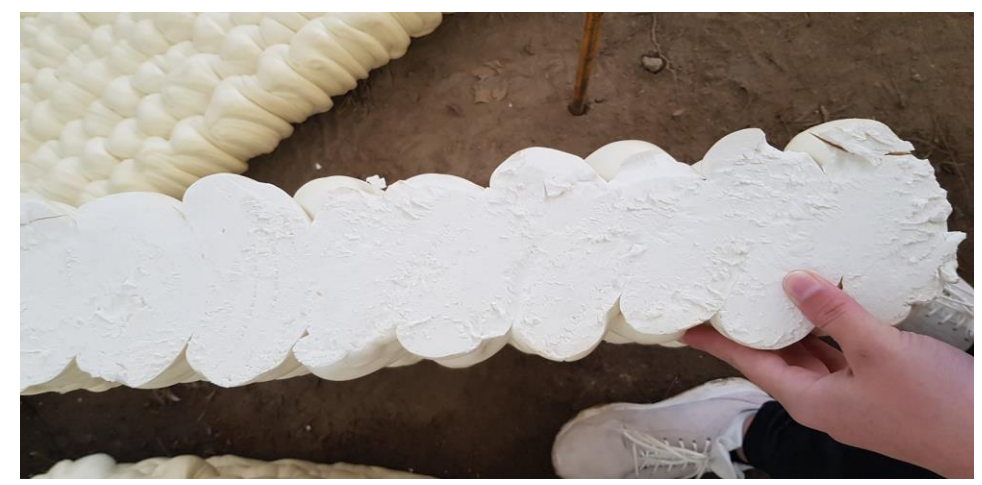
Image of a section through the extruded polyurethane foam, showing the variation between different layers.