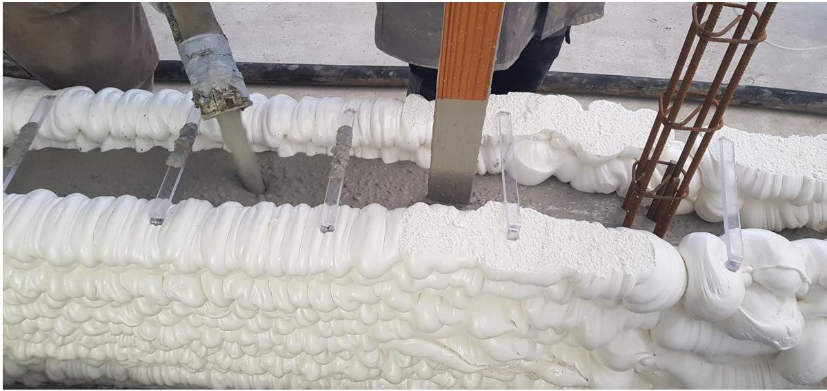
Concrete pouring in between the polyurethane formwork.

5. After the concrete has been cast throughout the perimeter of the building, another 300 mm of extruded foam is added on top of the existing one and the acrylic ties, securing them in place.